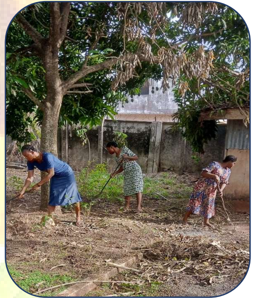
Postulants caring for the earth