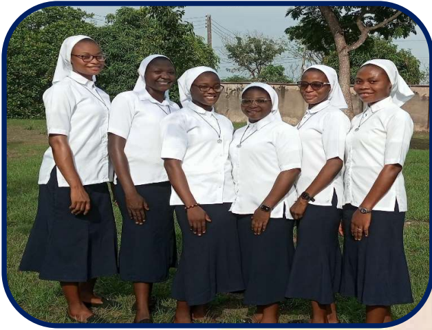
Some of the Postulants presently at the formation house