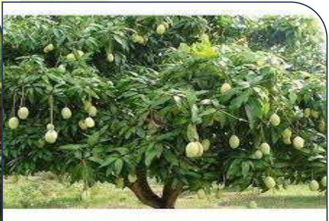
Some of our Fruit Trees