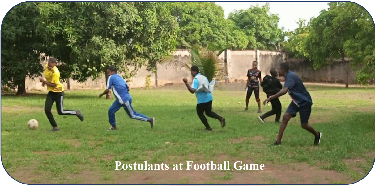
Postulants at Football Game